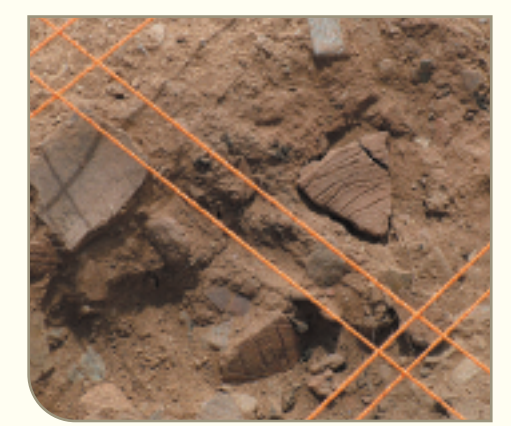
Bronze Age Beaker pottery exposed in the fill of a pit in Frankfort.

At Raheenagureen West, Beaker pottery had been buried in a shallow pit. A cobbled surface, a hearth and stake-holes suggest the presence of a flimsy structure close by. The discovery of a barbed and tanged arrowhead shows that the people who made and used the Beaker pottery may have supplemented their diet by hunting or that they may not have lived in total harmony with their neighbours!