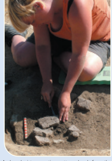
Archaeologist excavating pottery sherds from the medieval house foundations at Moneycross Upper.

The structural remains of the house bear similarities to the tradition of Anglo-Norman long houses. It was possibly occupied for a relatively short time by peasants of English origin who settled here as part of the Anglo-Norman colonisation of this part of north Wexford during the 12th/13th century. A large assemblage of medieval pottery was recovered from the features, as well as a bone awl and an iron arrow-head.