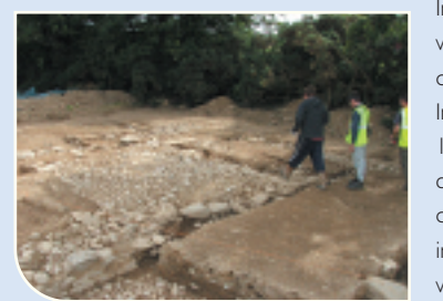
Foundations of a post-medieval farmstead were uncovered at Moneycross Upper.

In Moneycross Upper, the remains of a post-medieval farmstead were found. A number of buildings were marked in this location on the first edition Ordnance Survey map in the 1830s. Interestingly, this farmstead was probably inhabited during the 1798 uprising and the famine years. Sections of the foundation courses of the buildings were recorded and a broad range of domestic pottery and farming equipment were retrieved. One intriguing find was the discovery of a portion of a carved stone which seems to have been a part of a decorative window of a medieval tower house re-used as the threshold of one of the houses.