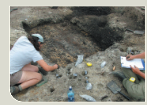
Archaeologists excavating the trough and associated stakeholes of a burnt mound at Ask

upstanding monument is enclosed by a concentric ditch which encircles an area about 80 m in maximum their grain after harvesting to make it easier to grind diameter. The outer ditch had a south-eastern entrance flanked by post-holes. Some of a number of oats and barley were recovered from the soil filling perforated stones recovered from the outer ditch fills could have served as weights or whetstones.