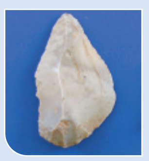
Later Mesolithic butt-trimmed flint flake tool discovered near the Banoge River at Coolnaveagh.