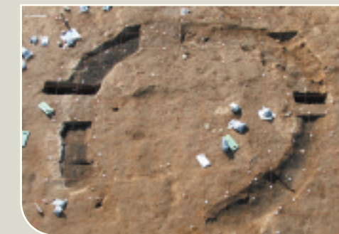
Excavation of a penannular ring-ditch at Coolnaveagh which contained burnt bone, charcoal and ash deposits. The site represents a place of burial in the Bronze Age or Iron Age.

The new road was designed to avoid destroying a ringfort in Raheenagurren West. Three grain-drying Excavation and geophysical survey has shown that the kilns, uncovered to the south of the ringfort, would have been used by the residents of the ringfort to dry or to ensure that it did not rot in storage. Charred the kilns. A fragment of a broken quern stone had been built into the wall of one of the kilns.