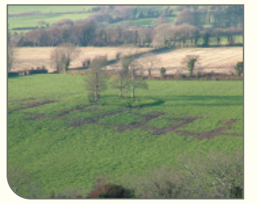
Multi-period site at Moneylawn Lower following test excavations with the low earthen bank of the ringfort visible.

That summer, on behalf of the National Roads Authority and Wexford County Council, archaeological excavations were carried out by Valerie J Keeley Ltd to ensure the investigation and preservation of rites in advance of road construction. Analysis of the results is ongoing, but it is clear that the work yielded a diversity of archaeological evidence dating from the nineteenth century AD to the fifth millennium BC. These discoveries are enabling archaeologists and historians to build upon the existing knowledge of man and the environment in this part of Ireland.